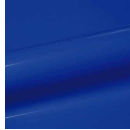
PU0138 ULTRA MARINE BLUE