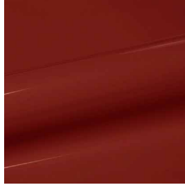
PU0136 PAPRIKA RED