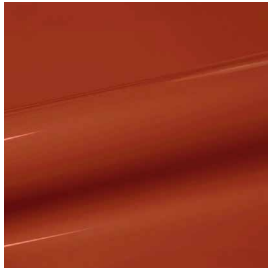
PU0135 AUTUMN ORANGE