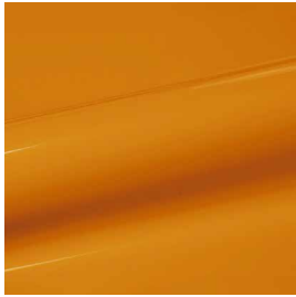
PU0134 AMBER YELLOW