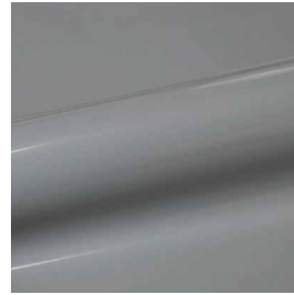
PU0018 STONE GREY